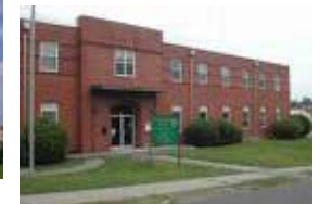
Strip Center Developments