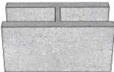
1-Web H Block