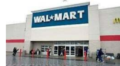
Retail Chain Stores

InsulSmart MH is typically used in commercial and institutional buildings such as . . .